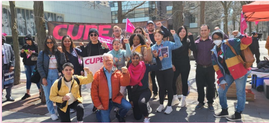
April 21: CUPE 3261 members joined other CUPE locals at a CUPE 233 solidarity rally

CUPE 233's fight for fair treatment and just compensation is important for all workers. The members of CUPE 233, like many of us, are service workers who keep the university running smoothly. By taking the bold step to strike, they demonstrated the power their members have when organized and united. The message is clear: service workers will fight back!